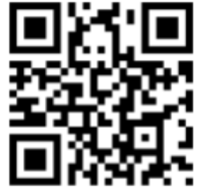
Chairperson Application Form